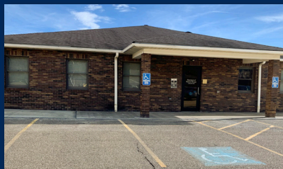
Trinity Medical Plaza, Building 2 St. Clairsville, OH