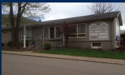
Witten Professional Building New Martinsville, WV