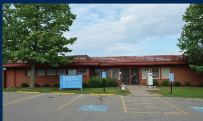
Barnesville Medical Center Barnesville, OH