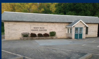
Glen Dale Vision Center Glen Dale, WV